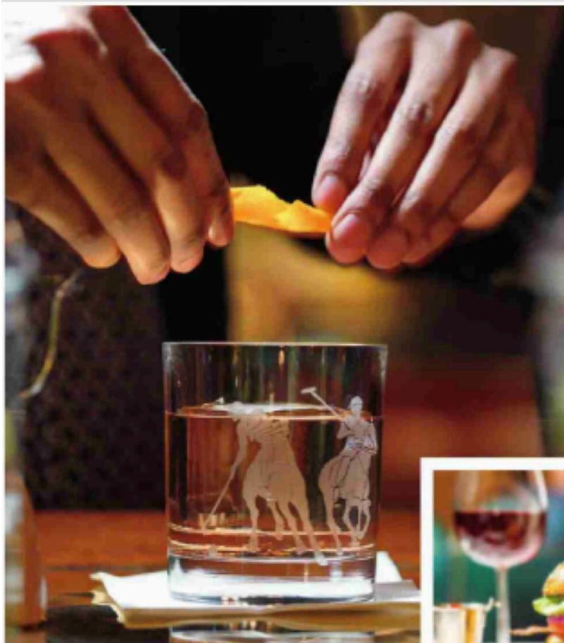
Clockwise from left: The Albertine cocktail; the Polo Bar Burger; the equestrian-themed lounge